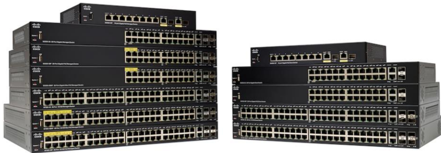
Figure 1. Cisco 250 Series Smart Switches

The Cisco 250 Series is the next generation of affordable smart switches that combine powerful network performance and reliability with a complete suite of the network features you need for a solid business network. These powerful Fast Ethernet or Gigabit Ethernet switches, with Gigabit or 10 Gigabit Ethernet uplinks, provide multiple management options, sophisticated security capabilities, fine-tuned Quality-of-Service (QoS) and Layer 3 static routing features far beyond those of an unmanaged or consumer-grade switch, at a lower cost than for fully managed switches. And with an easy-to-use web user interface, Smart Network Application, and Power over Ethernet Plus (PoE+) capability, you can deploy and configure a complete business network in minutes.